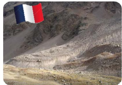
Ecrins massif From Les 2 Alpes to Laurichard