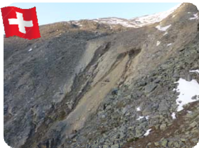
Valais Alps From Verbier to Zermatt