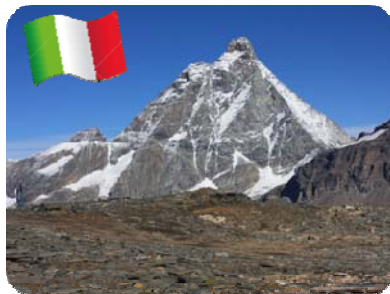
Aosta Valley From Mont Blanc to Matterhorn